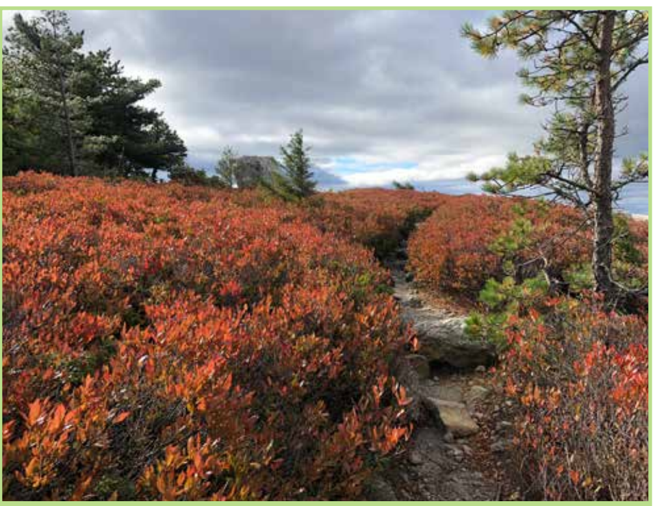
October: the air was nippy; the blueberries were red!

With more and more people visiting our parks and preserves it is more important than ever to protect them from the ravages of overuse by educating the public about 'Leave No Trace' and other conservation principles. If you or someone you know would like to volunteer to be a trail or summit steward in the Catskills, contact the Catskill Conservation Corps at https:// catskillconservationcorps.org/volunteer/. To volunteer to be a steward in the East Hudson Region, contact the New York-New Jersey Trail Conference at <a href="https://">https://</a> www.nynjtc.org/vop/trail-steward.