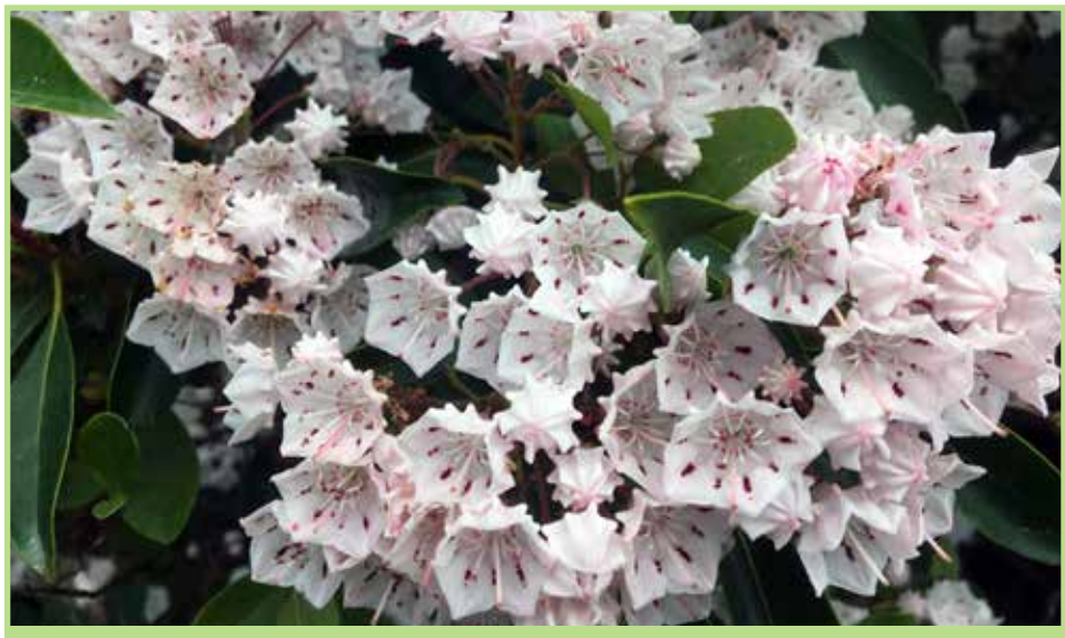
June in Minnewaska means Mountain Laurel

Julie III Willinewaska illealis Woulitalii Laurei